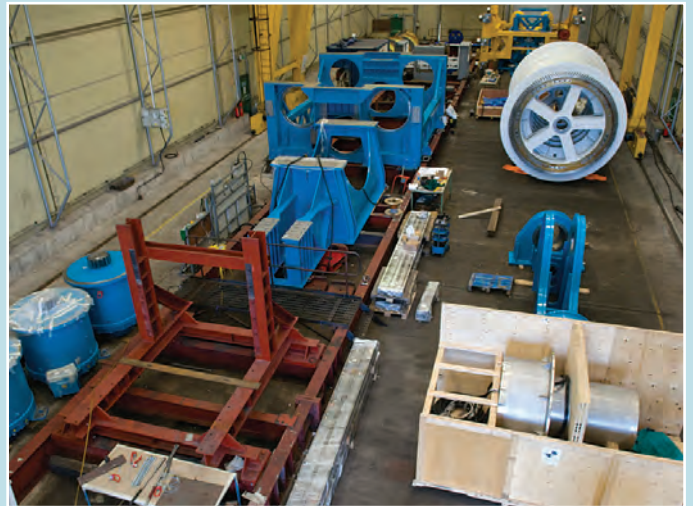
Fibre rope winch components kitted to start assembly