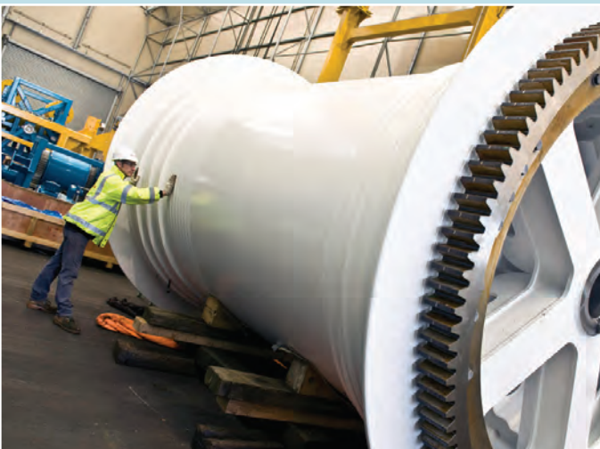
Fibre rope winch profiled drum