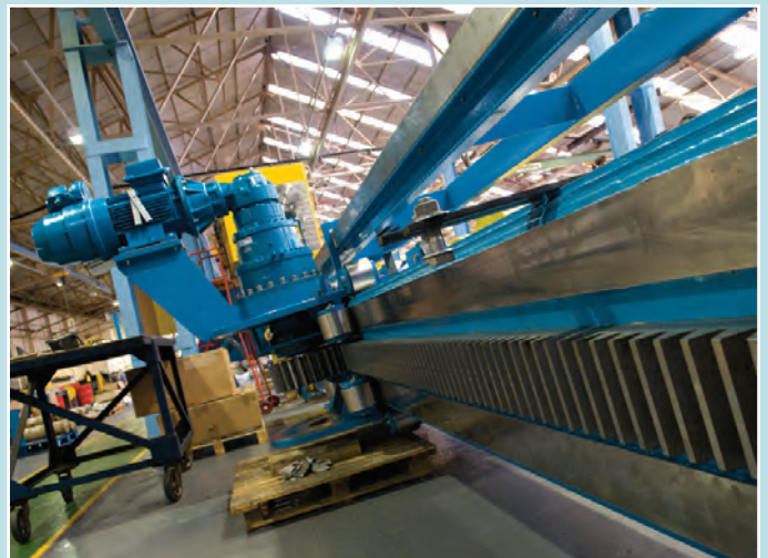
Fibre rope winch spooling level wind