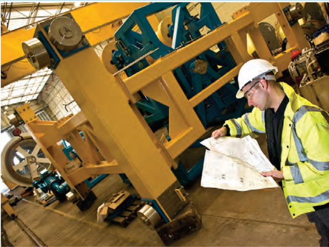
Handling tower's gimballed cursor