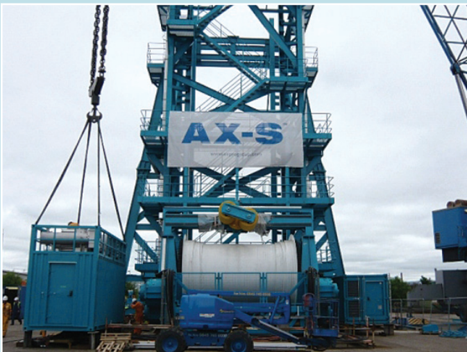
85mt AHC fibre rope winch and handling system