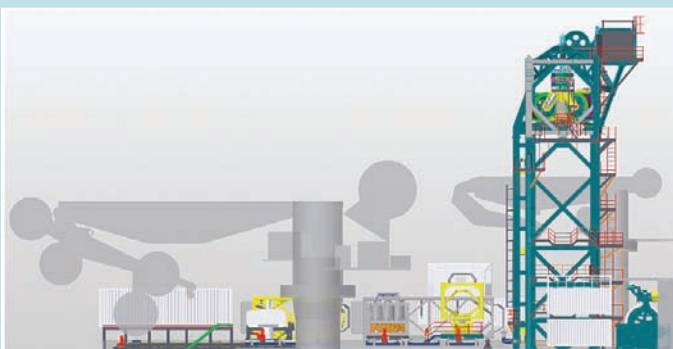
Handling equipment on vessel