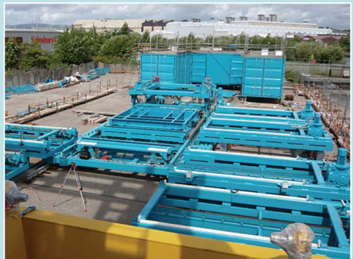
Back deck safe handling system and integrated tool workshop