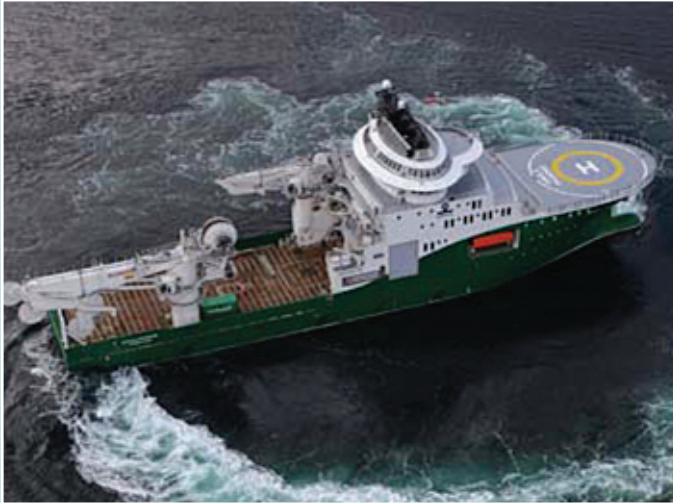
Havila Phoenix showing off its DP capabilities