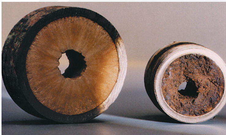
© Expro International Group LTD SurgeTank 230108_v1

The program development performed by the Technical University of Trondheim has been supported by Statoil and Hydro. The program is marketed and distributed worldwide by Expro.