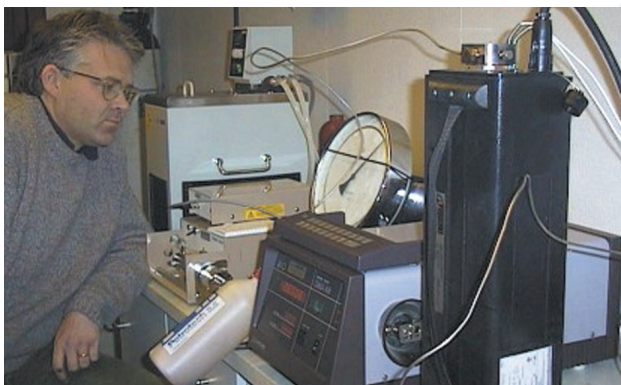
Figure 1: WFS VALIDITY AND DETAILED ANALYSIS

The wireline formation tester tools are usually run after a logging and a cleaning trip. The tools are designed for multiple pressure measurements to establish fluid gradients and collect single or multiple samples for fluid characterisation. Some of the tools that belong to this class are RFT (Repeat Formation Tester), MDT (Modular Dynamics Tester), RCI (Reservoir Characterisation Instrument) and RDT (Reservoir Description Tool).